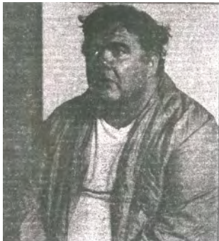
This is me before I started listening to KFAC. Overweight, poor, unhappy and alone.