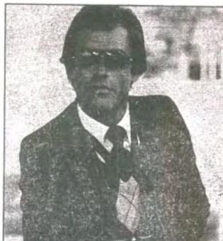
This is me after 16 short years as a KFAC listener. Rich, trim, sexy.