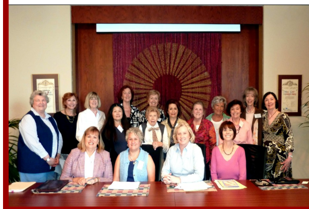
Pictured above are Board members at the last meeting of the 2009-2010 year. New officers assume duties June 1, 2009. The Board meets at the Music Center the first Thursday of every other month.