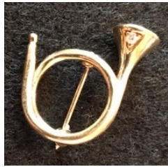
COPW 25-Year Service Pin

Congratulations to the following Members for their 25 years of dedicated service: