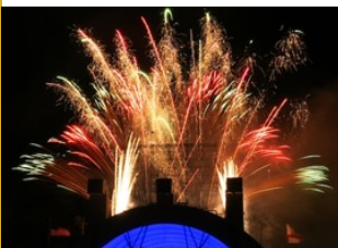
Fireworks at the Bowl are truly inspiring to behold