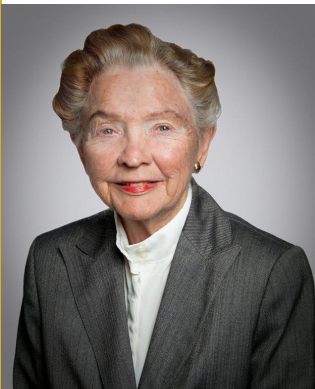
Hon. Shirley Hufstedler