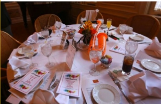
Rea Crane's creative and fun table settings helped set the mood. Mimosas too!