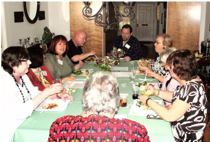
Enjoying the lovely party