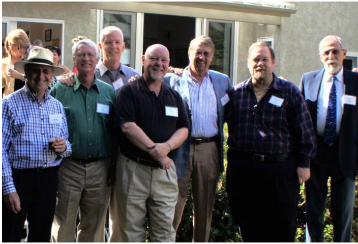
The Men of COPW