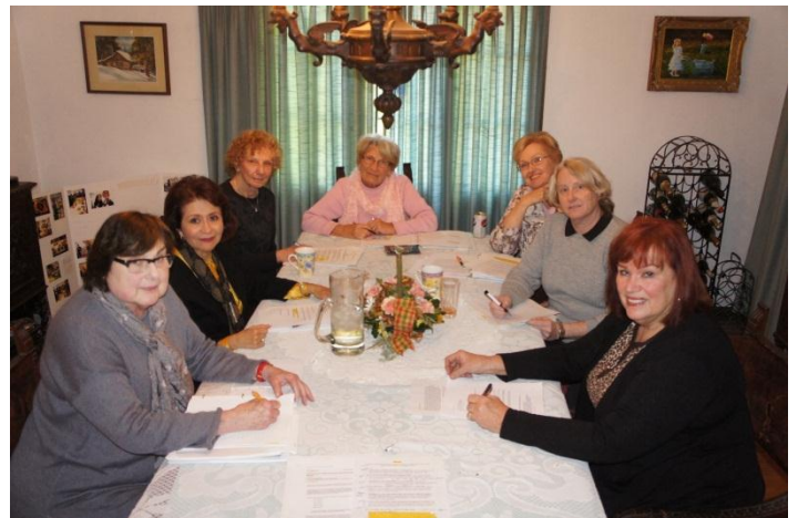
COPW EXECUTIVE BOARD AT WORK

LETTER AND NEWS WEBSITE: Will be reviewed and revised as necessary to upgrade content and insure promulgation of our COPW brand.